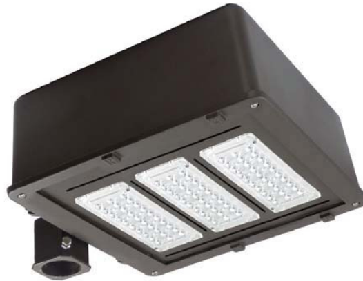
Replace 400W HID