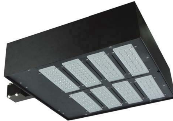
Replace 1000W HID