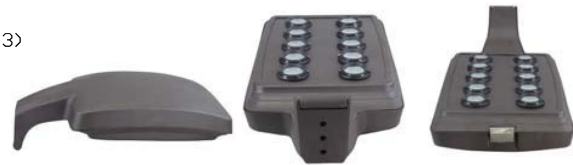
Optional Module Design